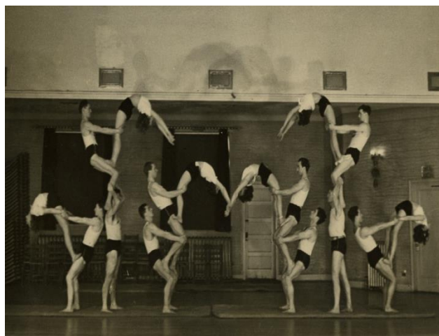
Gymnastic Club, Winnipeg, Manitoba, 1935. Photograph from the Workers' Sports Association Photograph Collection.