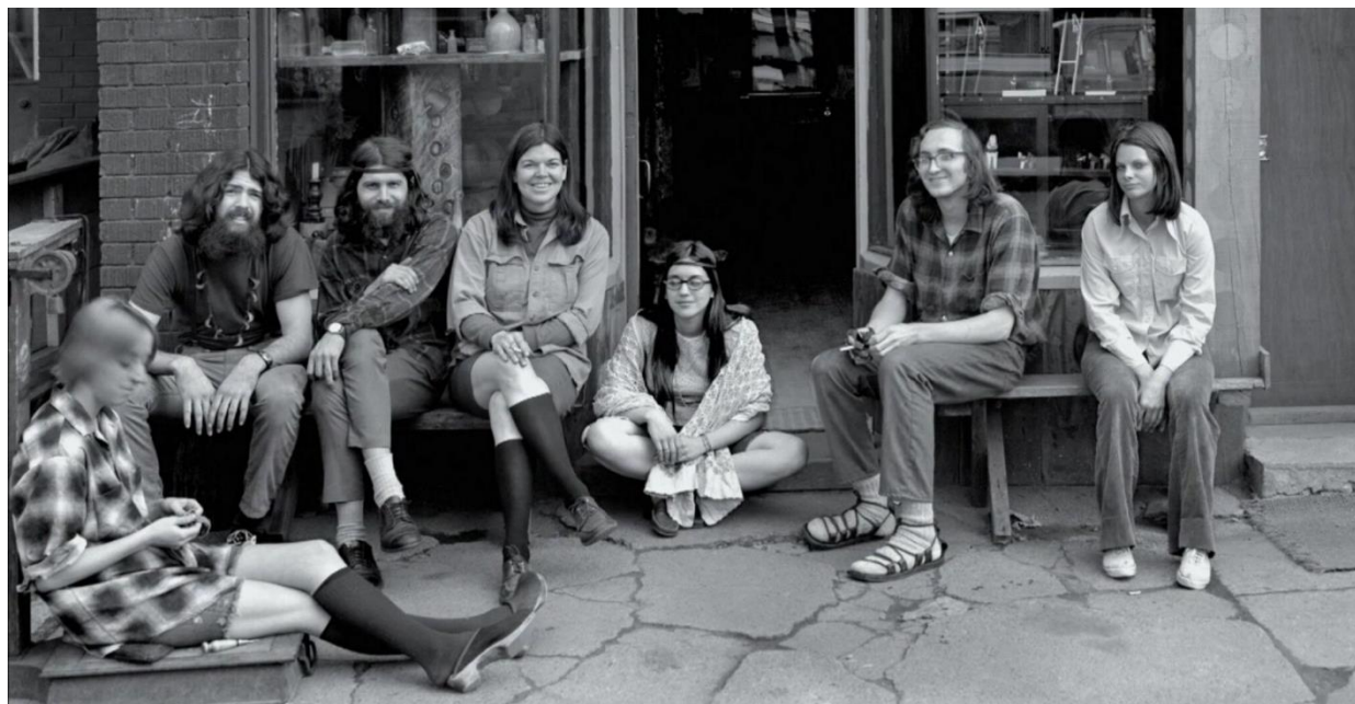
Ragnarokr Leather Cordwainery, Baldwin Street, Toronto, ca. 1970.