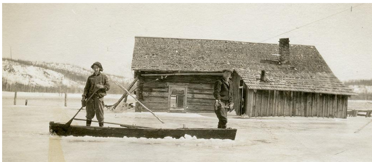
Flood in Whitefish, Ontario, 1928.